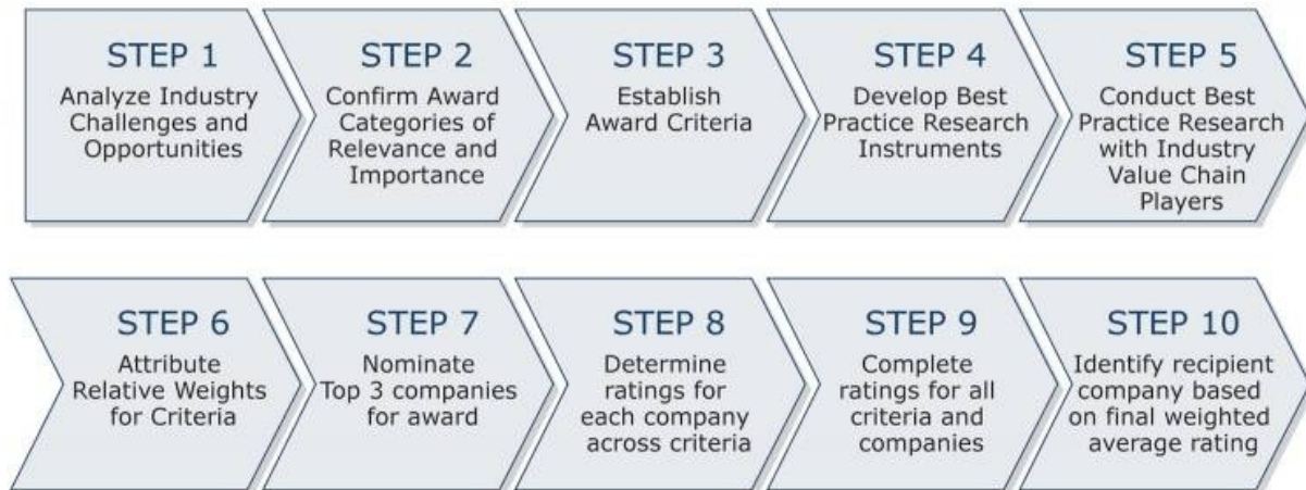
Chart 2: Frost & Sullivan’s 10-Step Process for Identifying Award Recipients