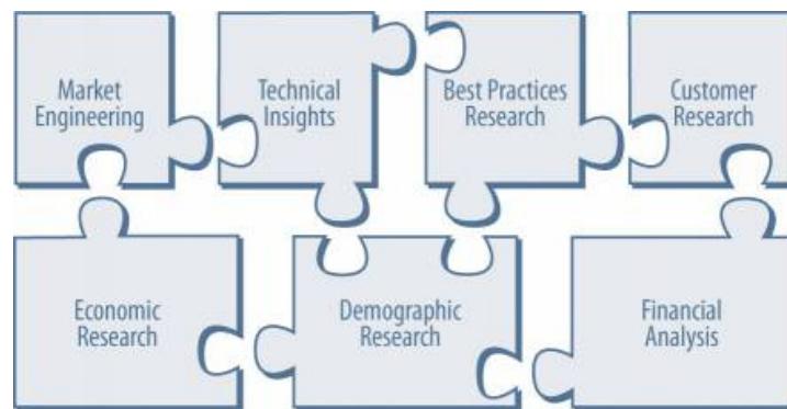
Chart 5: Benchmarking Performance with TEAM Research

Frost & Sullivan's TEAM Research methodology represents the analytical rigor of our research process. It offers a 360-degree view of industry challenges, trends, and issues by integrating all seven of Frost & Sullivan's research methodologies. Our experience has shown over the years that companies too often make important growth decisions based on a narrow understanding of their environment, leading to errors of both omission and commission. Frost & Sullivan contends that successful growth strategies are founded on a thorough understanding of market, technical, economic, financial, customer, best practices, and demographic analyses. In that vein, the letters T, E, A and M reflect our core technical, economic, applied (financial and best practices) and market analyses. The integration of these research disciplines into the TEAM Research methodology provides an evaluation platform for benchmarking industry players and for creating high-potential growth strategies for our clients.