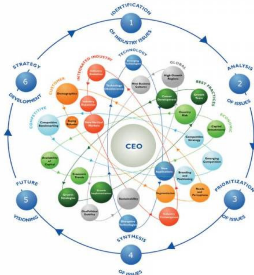
Chart 4: How the CEO's 360-Degree Perspective™ Model

The CEO 360-Degree Perspective™ model enables our clients to gain a comprehensive, action-oriented understanding of market evolution and its implications for their companies' growth strategies. As illustrated in Chart 5 below, the following six-step process outlines how our researchers and consultants embed the CEO 360-Degree Perspective™ into their analyses and recommendations.